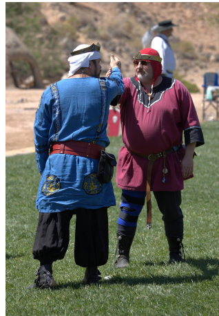
It's all about the mechanics