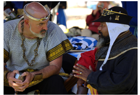
Sharing good conversation