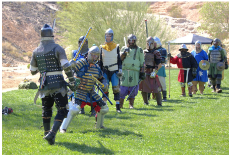
Combatants in line for the Warlord Fights