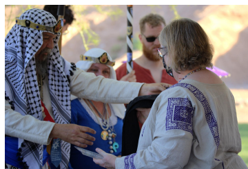
Lady Blissot is the new Flame Artisan