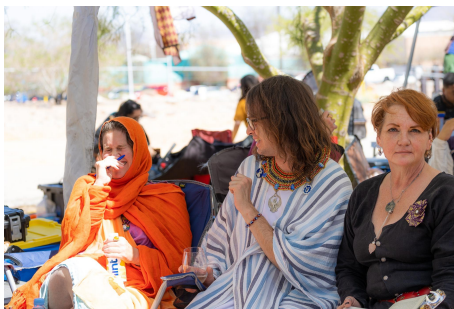
Enjoying good company