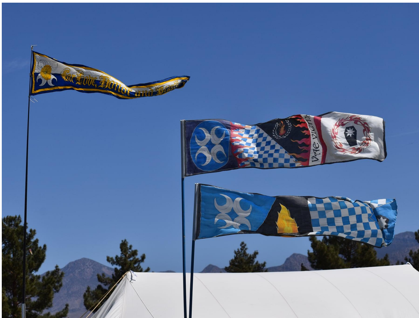
Banners at Starkhafn's Ruby Anniversary