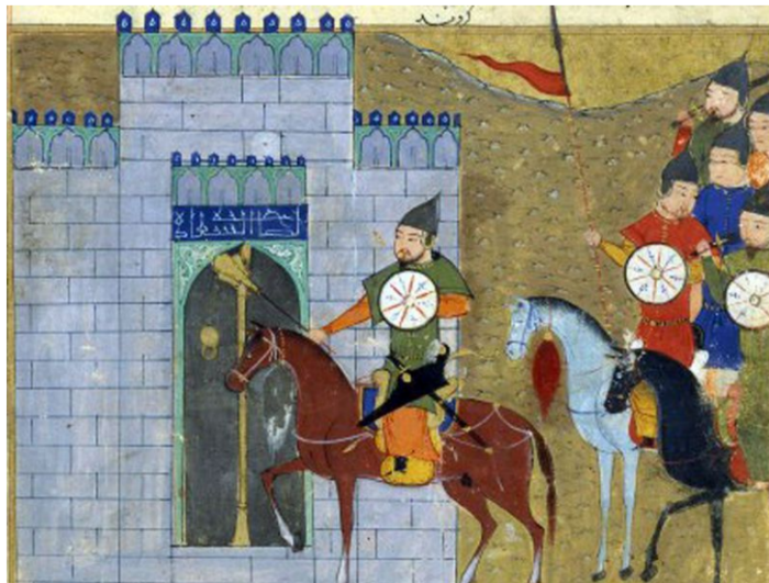
Genghis Khan attacked and captured the Jin capital of Zhongdu (now Beijing, China) in 1215 (Sayf al-Vâhidî, Wikimedia Commons)